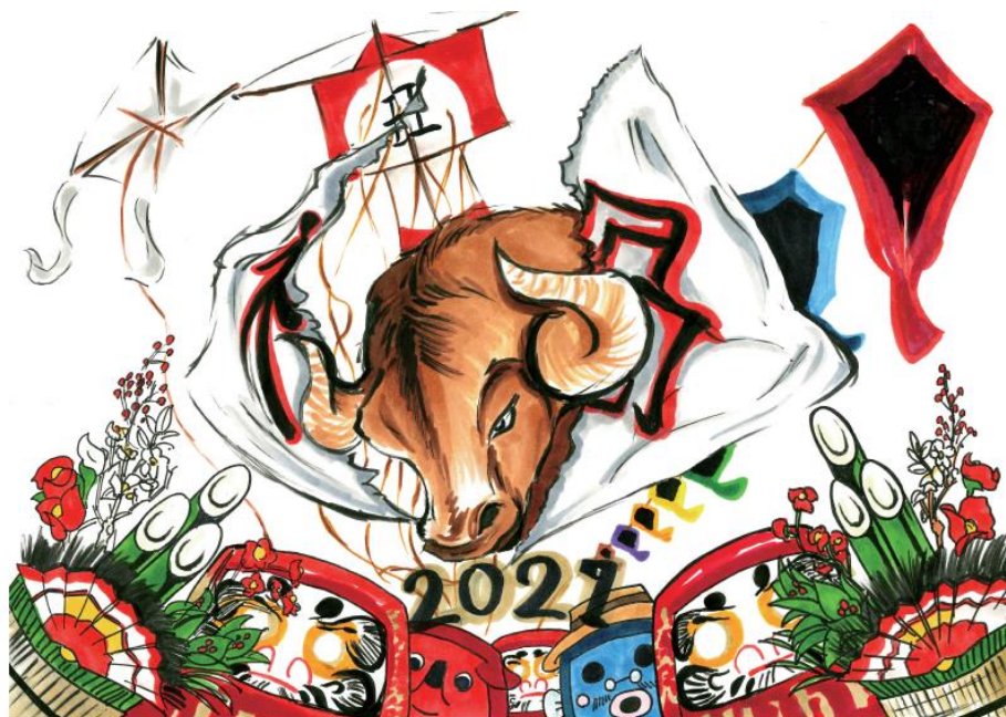
Illustration by Daichi Tanaka, Abiko junior high school. This illustration was selected from 26 entries at 14 elementary and junior high schools in the city.

Excerpts of the Newsletter issued by Abiko City Phone:04-7185-1111